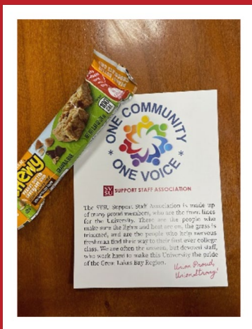
Info card and granola bar for the SA Exam bags