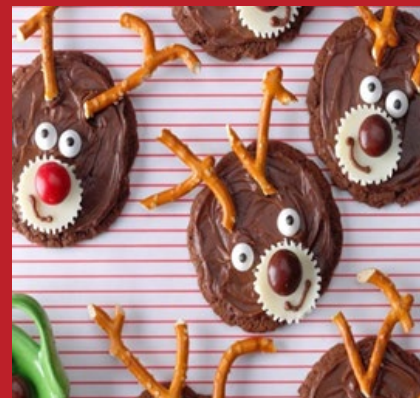
Chocolate Reindeer Cookies recipe on page 5